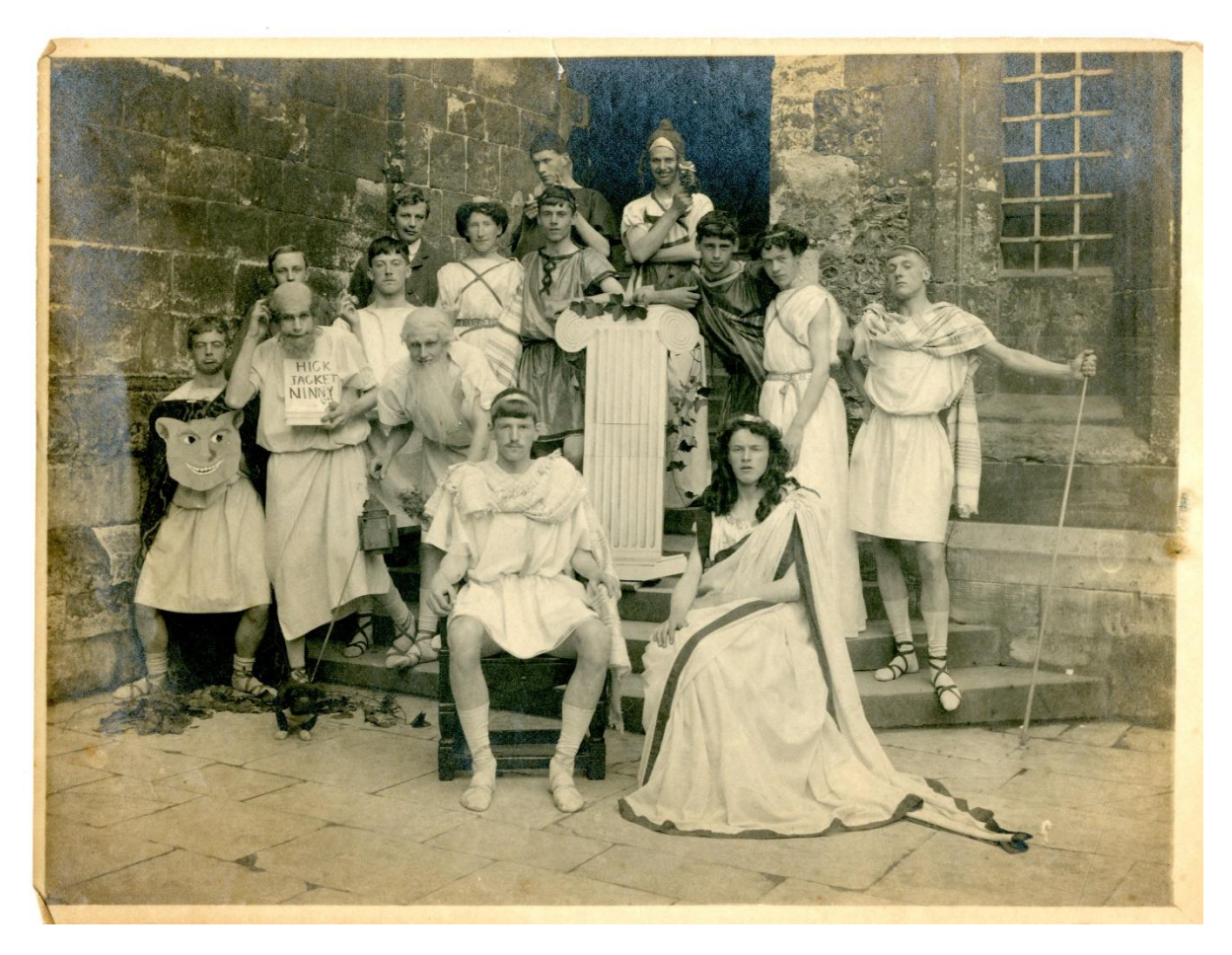
This photograph shows the costumed cast of a WinColl production of A Midsummer Night's Dream .

'The fact that Shakespeare should have been, of all things, a dramatist is one of the great cosmic jokes of all time,' writes Martin Amis. All a playwright does, he suggests, is to 'finish the dialogue', and a finalised play-text is no more than 'the equivalent of note form', waiting to be completed in performance.