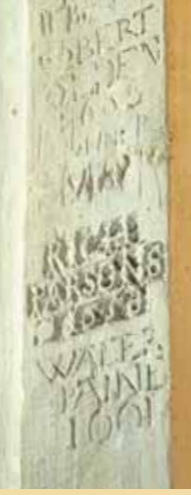
Graffiti in the Exchequer Room