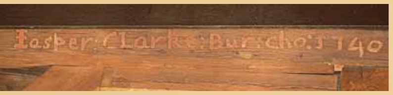
Quirister's Clerk graffiti

There are some other gems. The four Anglo-Saxon charters that come from Hyde Abbey are the oldest and the rarest items. Three appear to be entirely authentic: King Edmund's grant to the Abbey of the manor of Pewsey (940 AD), Cnut's grant of the manor of Drayton (1019), and the Abbey's lease for land at Chiseldon to Alfred, minister of King Athelstan (924-939). The fourth is perhaps the most interesting of all and purports to grant lands at Micheldever to the Abbey in the name of Alfred's son, Edward the Elder (899-924). It is a forgery of the late-tenth or early eleventh century and is almost certainly based on an original, genuine charter, whose terms the forger ingeniously enlarged so as to buttress the Abbey's claims to privileges and rights of jurisdiction through the whole hundred of Micheldever.