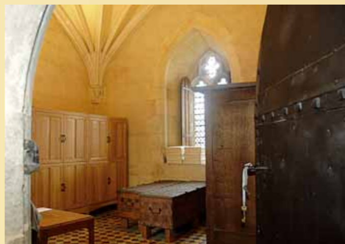
Lower Muniment Room

The Founder's statutes laid responsibility for maintaining and preserving the College's records on the Warden and the two Fellows appointed annually as Bursars. For the most part, these duties seem to have been discharged conscientiously, but there were occasional lapses and some records and documents found their way to cupboards and cubby-holes in the Warden's Lodgings, where for a time they were lost. Four Anglo-Saxon charters, the oldest documents among the College's archives, strayed this way until they were found in 1926 in the bottom of a drawer in a bedroom in the Warden's Lodgings, wrapped in brown paper. A unique