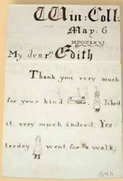
Herbert Hope Risley's pictogram letter

What makes the muniments of Winchester College so remarkable and unusual is the completeness and the time span, from the late-fourteenth century down to the present day. In this brief article it is impossible to give more than a fleeting impression of the variety and interest of the record that they constitute.