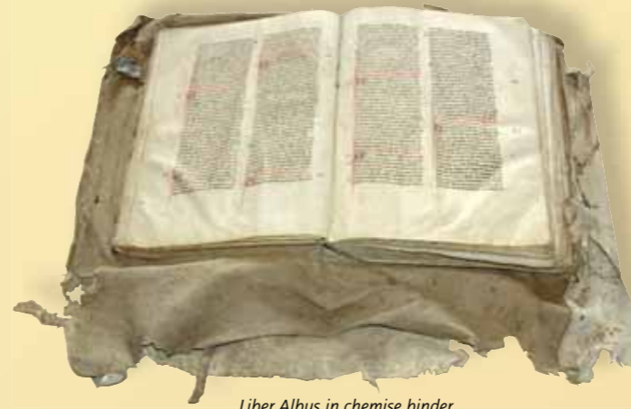
Liber Albus in chemise binder

manuscript of Malory's Morte d'Arthur was discovered in 1932 and as late as 1962, a bundle of papers, some of them dating back to the seventeenth century, turned up unexpectedly in the Warden's study. In 1977 the oldest private letter in English among the archives (dated 1487) was found under the floorboards of Election Chamber. There may be yet more to come.