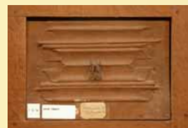
Linen fold drawer

The Lower Muniment Room, the 'Treasury' of the Statutes, is a handsome vaulted chamber, with a medieval tiled floor. The corbels supporting the vaulting ribs are decorated with four symbolic sculpted figures, representing respectively a king, a bishop and an abbot; the fourth is St Michael, perhaps because the accounts ran from Michaelmas to