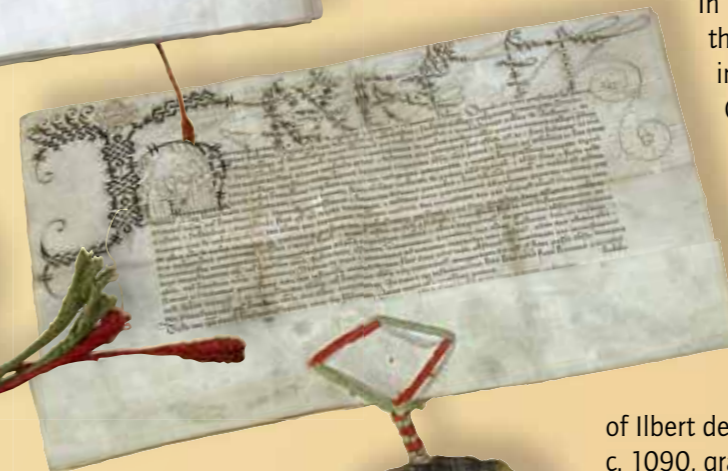
Henry VI's Licence

The 1976 catalogue lists and numbers all the muniments up to 1873. There are more